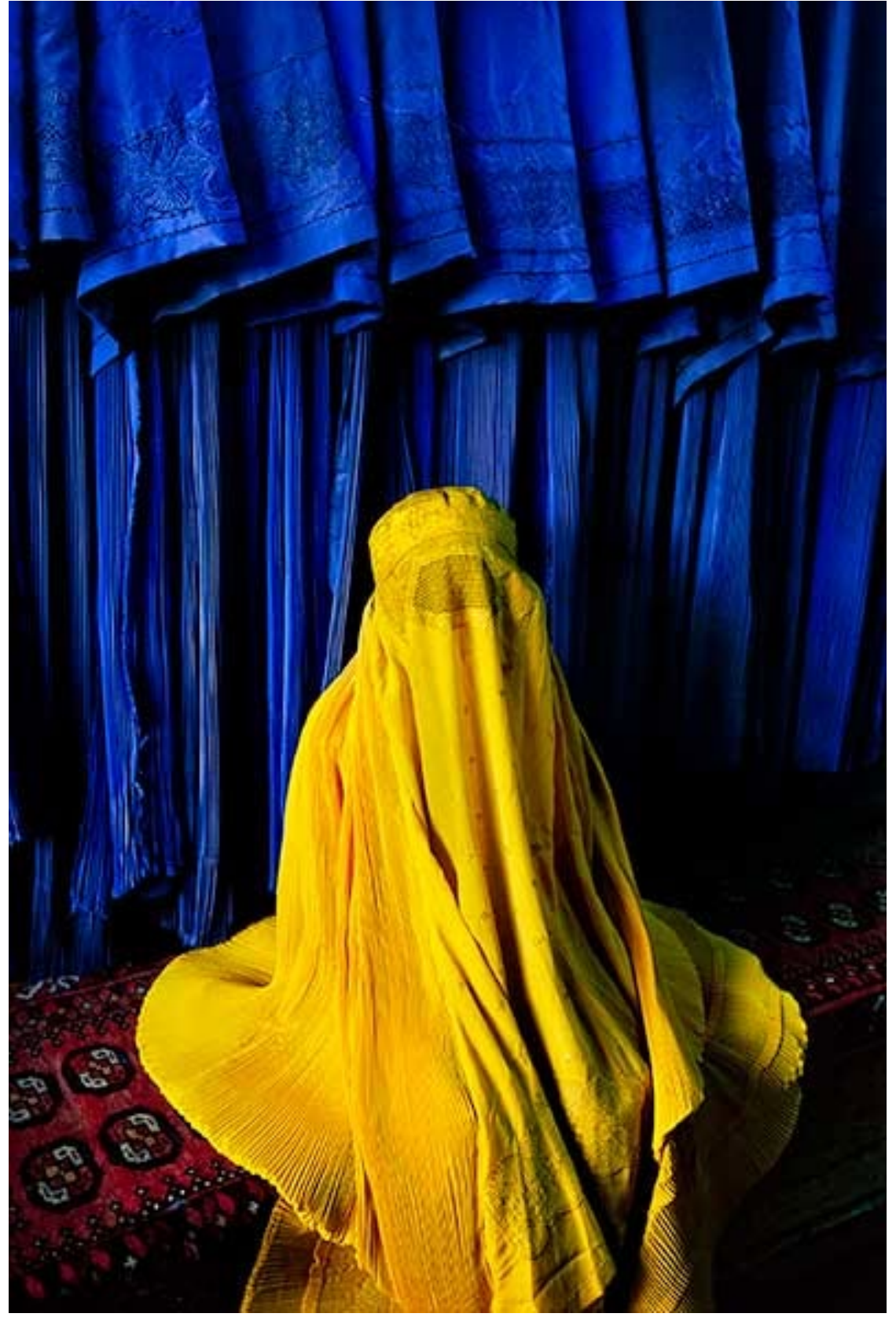
Figure 1. Steve McCurry, Woman in Canary Burqa (2002)